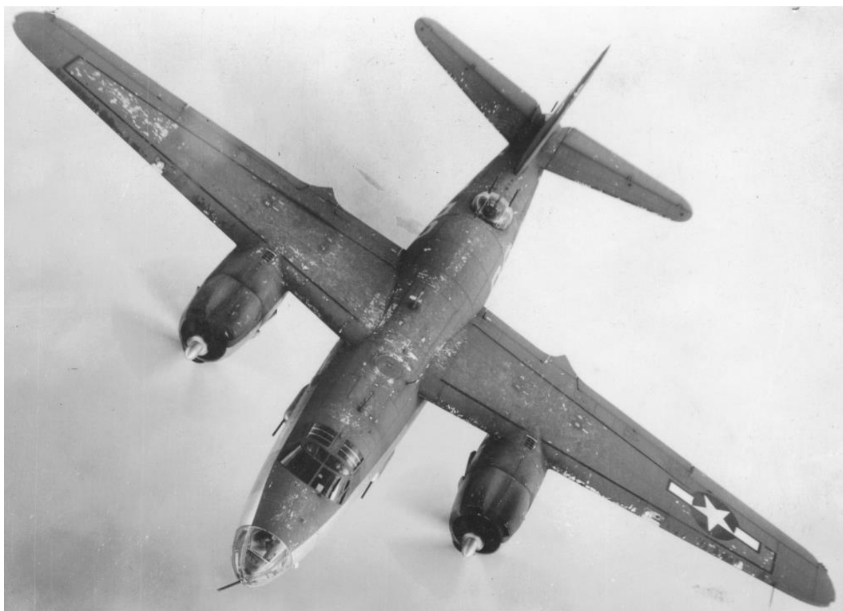
Figure 4. The Martin B-26 Marauder.