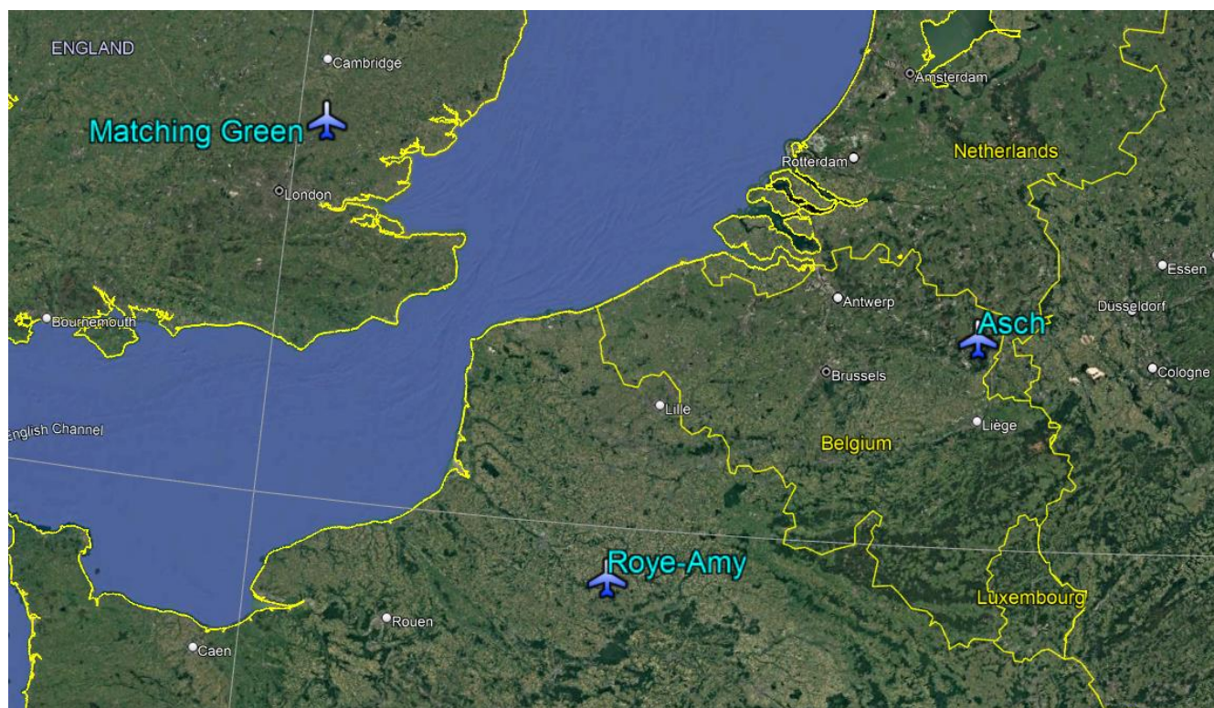
Figure 3. Airfield locations.