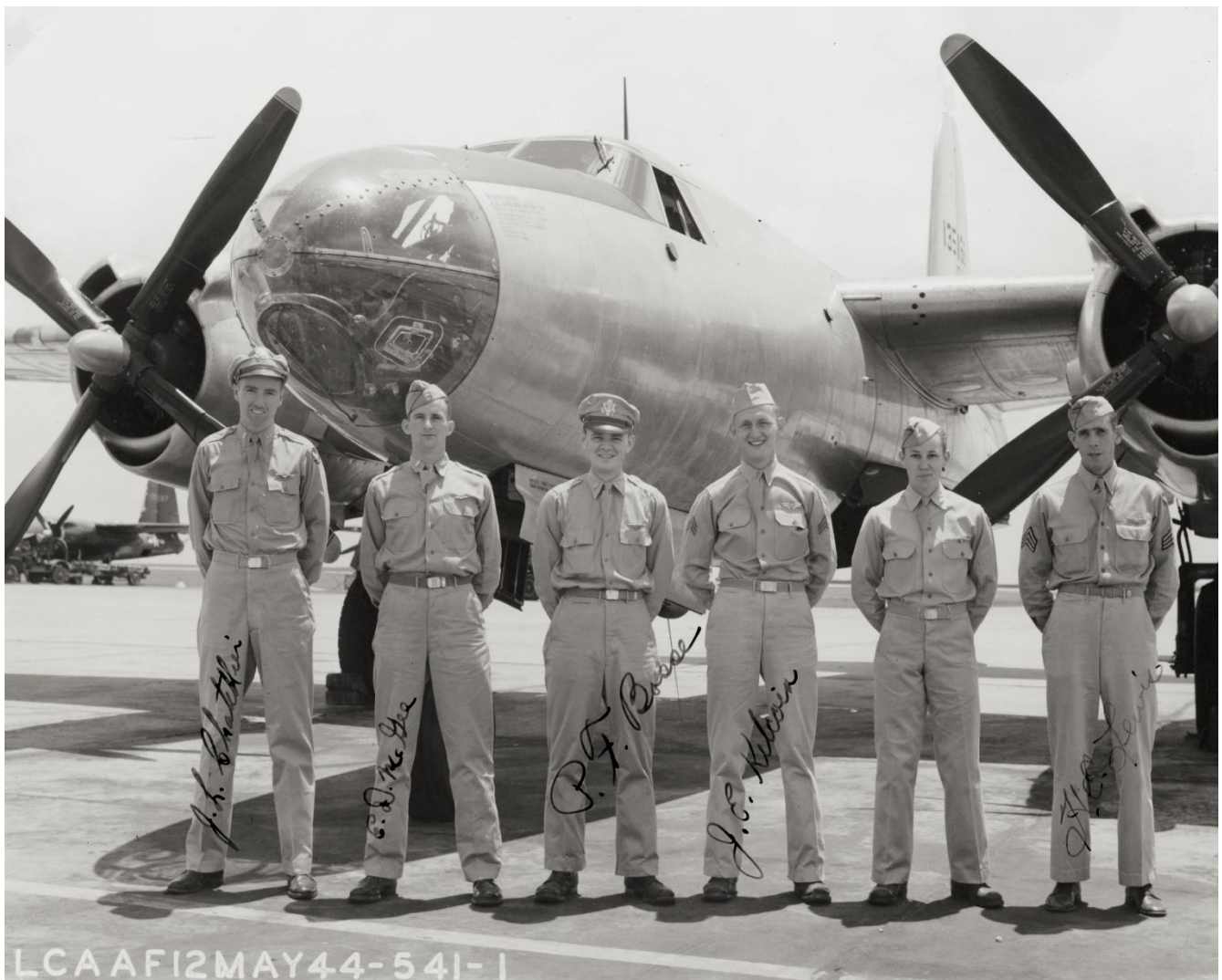
Figure 1 Initial Crew picture. Flew ferry mission from Hunter AAF to Grove England